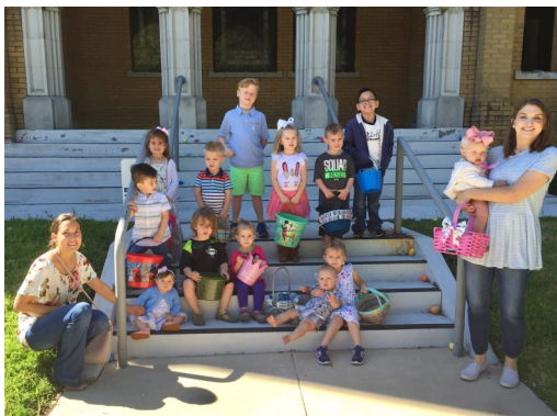
2019 Easter Egg Hunt